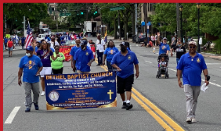
On June 11, 2022 Bethel Baptist Church participated by marching in the Juneteenth Parade and represented in the festival with our church booth. Thank you Deaconess for organizing the volunteers.